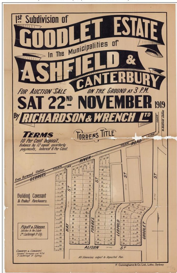
Above: Map of the 1919 1 st subdivision of the Goodlet Estate, which includes the area covered by the Goodlet Heritage Conservation Area